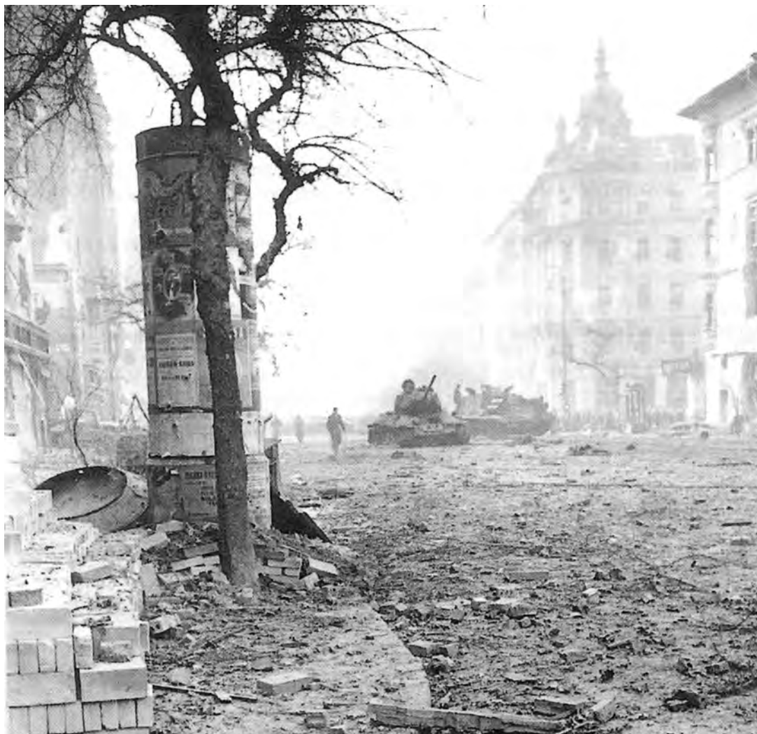
A street scene in Budapest, October 1956.

8 Study the photograph, and then answer the questions which follow.