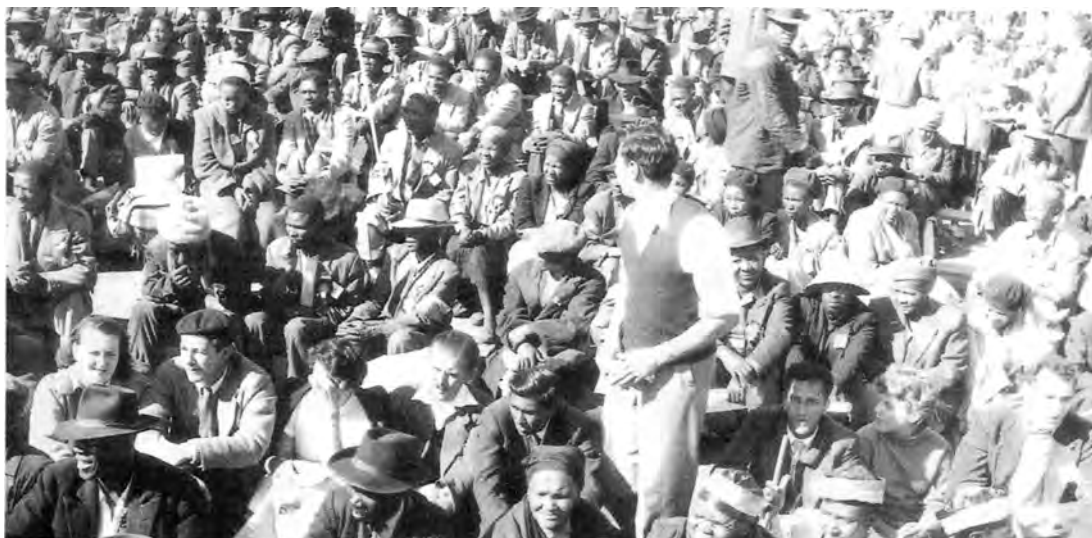
Some of the crowd at the Congress held at Kliptown, June 1955, when the Freedom Charter was signed.

18 Study the photograph, and then answer the questions which follow.