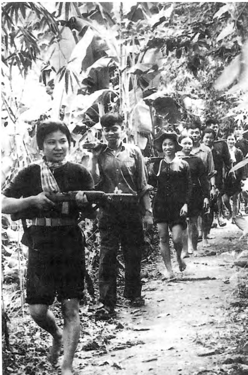
A Vietcong patrol in South Vietnam, 1966.

7 Study the photograph, and then answer the questions which follow.