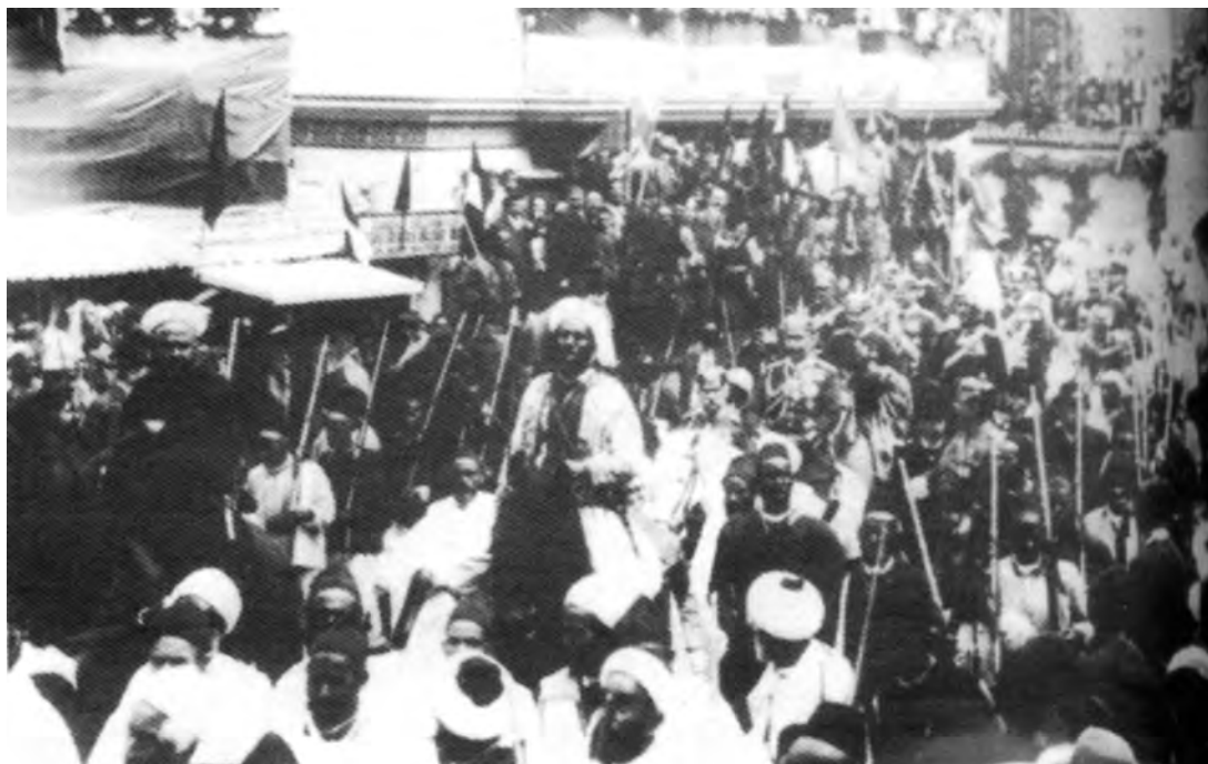
Kaiser Wilhelm's soldiers riding through the streets of Tangier in 1905.