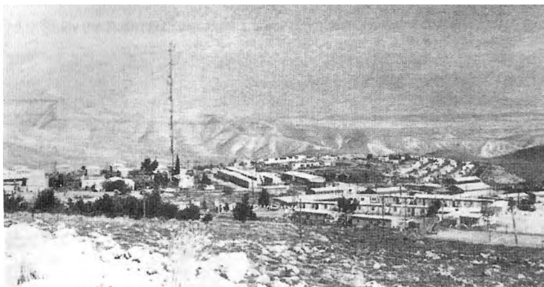
One of the new Jewish settlements set up in the 1970s.

21 Study the photograph, and then answer the questions which follow.