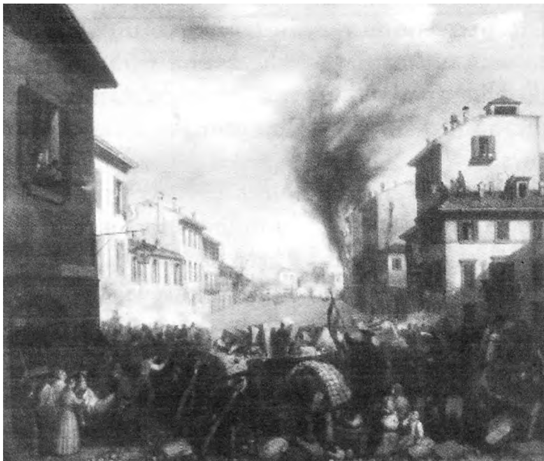
A street battle in the Milan uprising, March 1848.

2 Study the picture, and then answer the questions which follow.