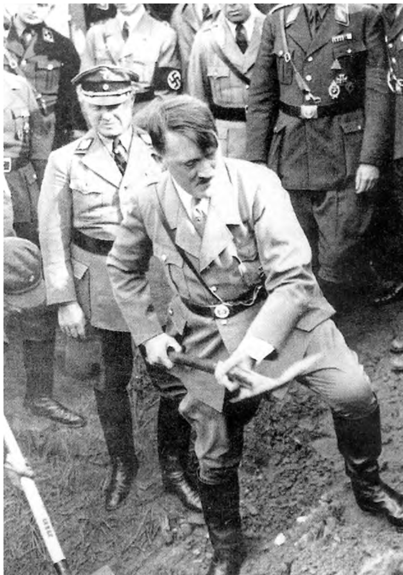
Hitler starts the construction of the first autobahn, 1933.

10 Study the photograph, and then answer the questions which follow.