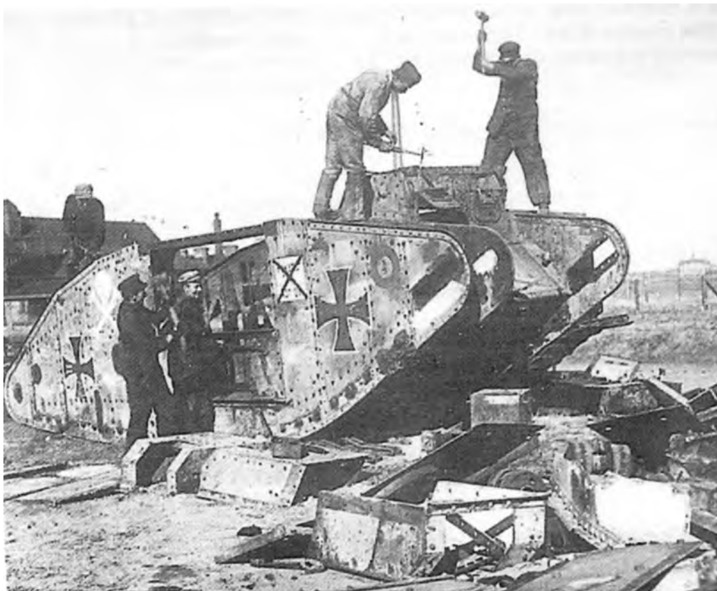
A German tank being dismantled in order to comply with the Treaty of Versailles.